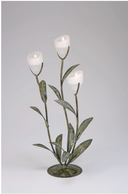
COMES WITH FROSTED GLASS VOTIVE HOLDERS, INCLUDES 1 EXTRA VOTIVE HOLDER