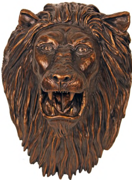
ANTIQUÉ BRONZE FINISH, PIPED TO BE A FOUNTAIN

METAL FORSET VOTIVE HOLDER 36"H X 13"W X 9"D