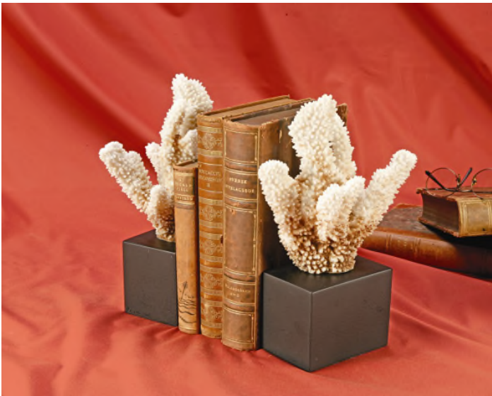
SOLD IN PAIRS